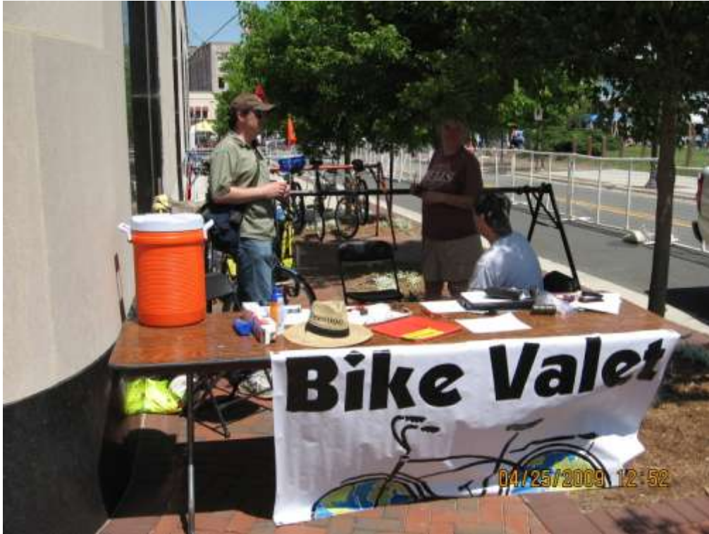
Bike Valet Parking at the 2009 Earth Day Festival