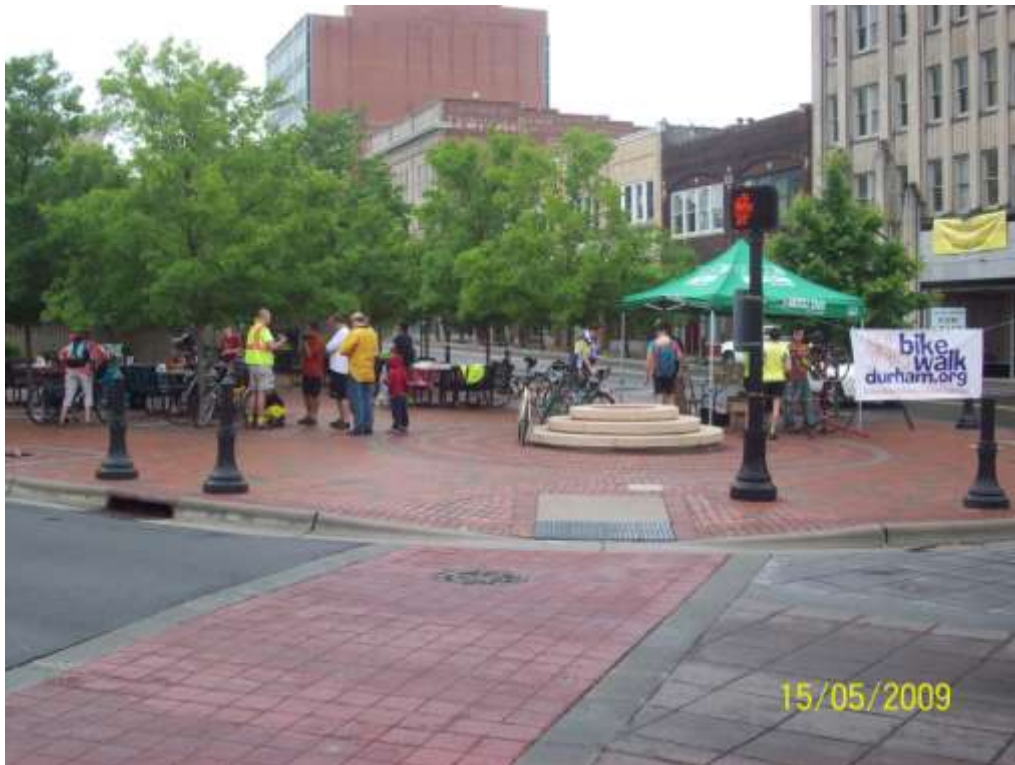
2009 Bike to Work Week Breakfast