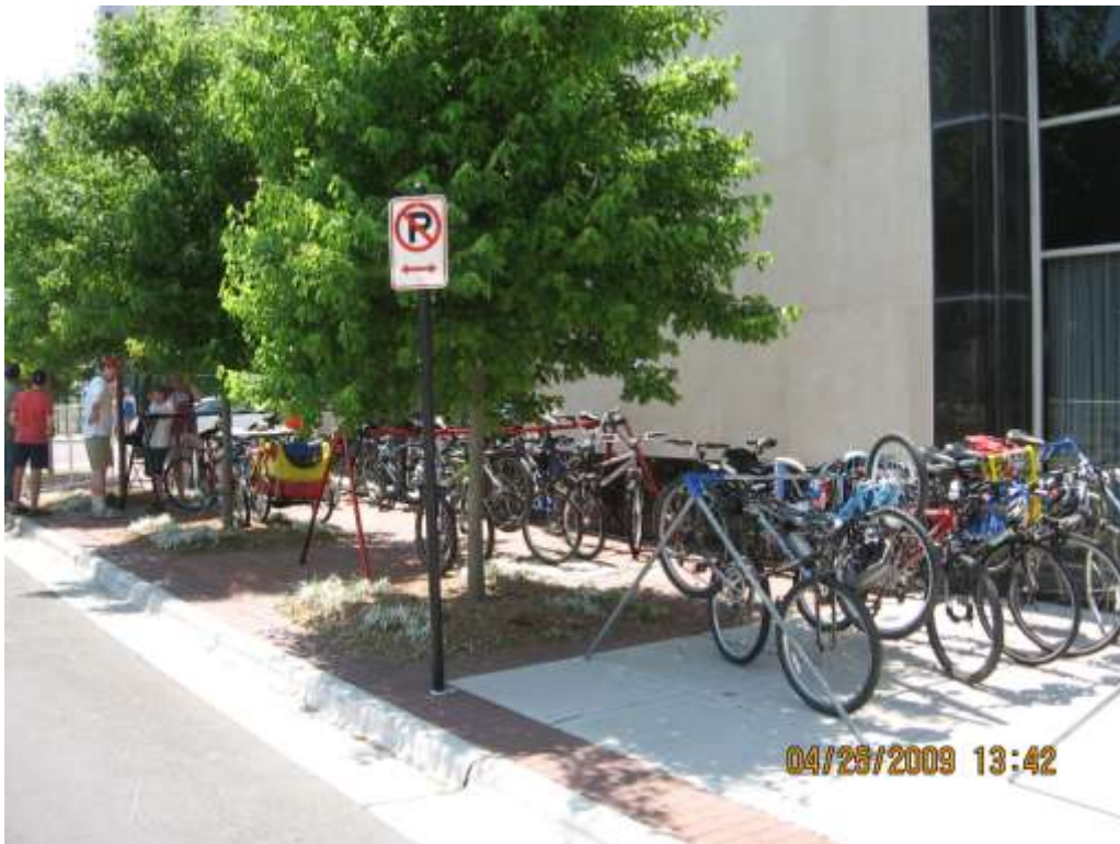
Bike Valet Parking at the 2009 Earth Day Festival.