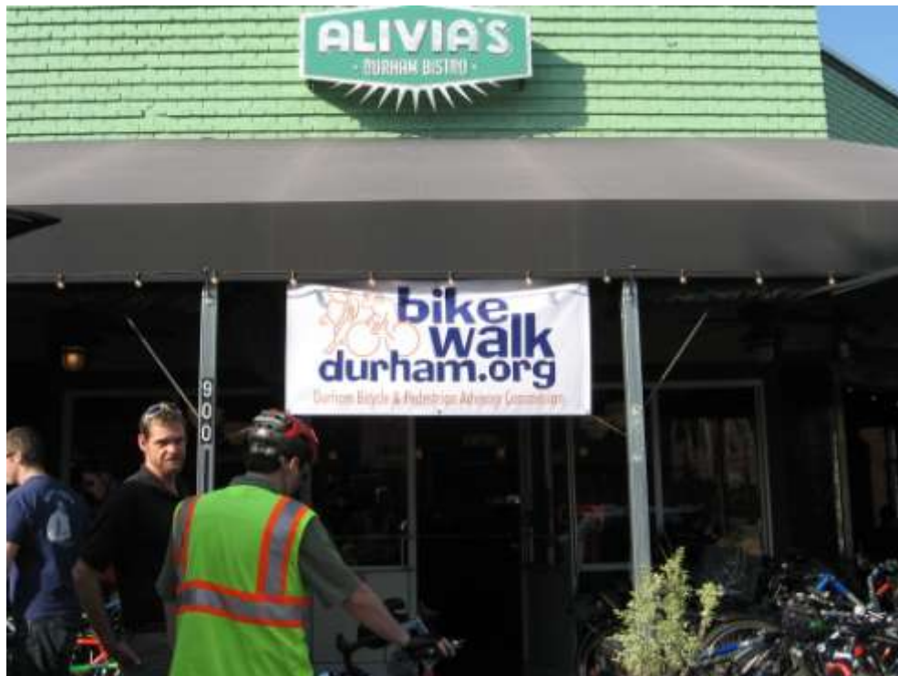
New BPAC Banner at Bike to Work Week After Work Event