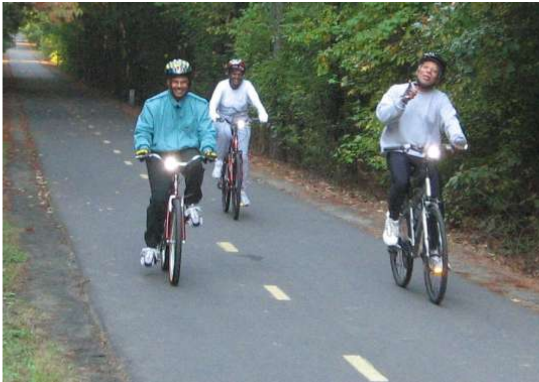
The American Tobacco Trail continues to be a popular facility for active transportation.